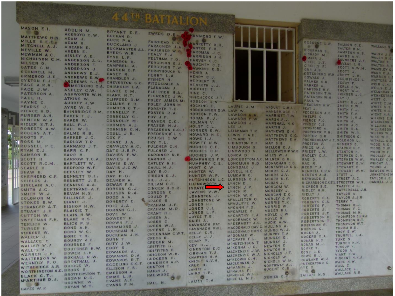
44th Battalion Panel