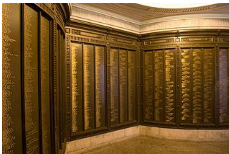
South Australian National War Memorial